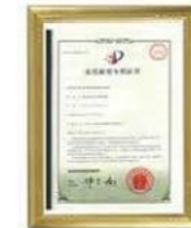
专利产品 Patented product