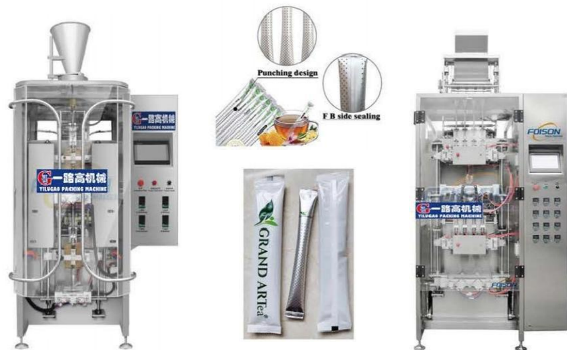
单列内外袋茶棒包装机 Single line tea stick packing machine

Mutli lines perforated tea stick inner and outer bagpacking machine