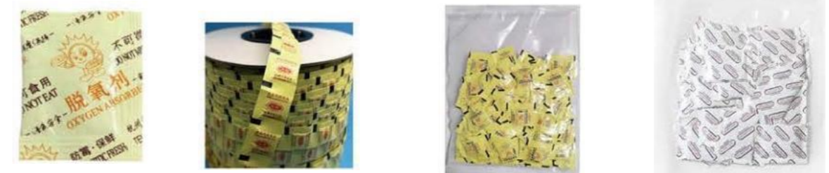
三边封袋型 3 sides sealing

This Packing machine line is suitable for 3 sides sealing sachet packing for granule, powder, liquid product etc. The line is combined by multi lines sachet packing machine, counting system, second time sachet counting and second time pillow bag packing etc. It could be customized the bag size, checker weighing system etc.